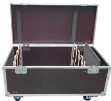
Flight-case (x8 pcs)